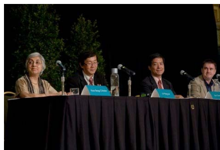
(Above) Members of the International Panel