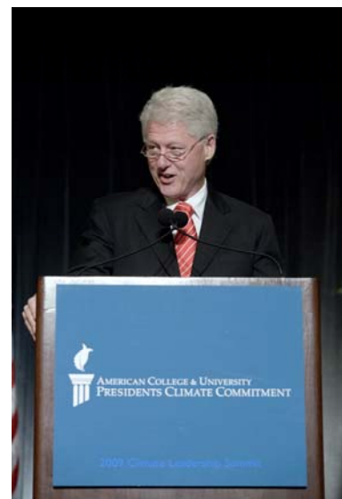
President Bill Clinton